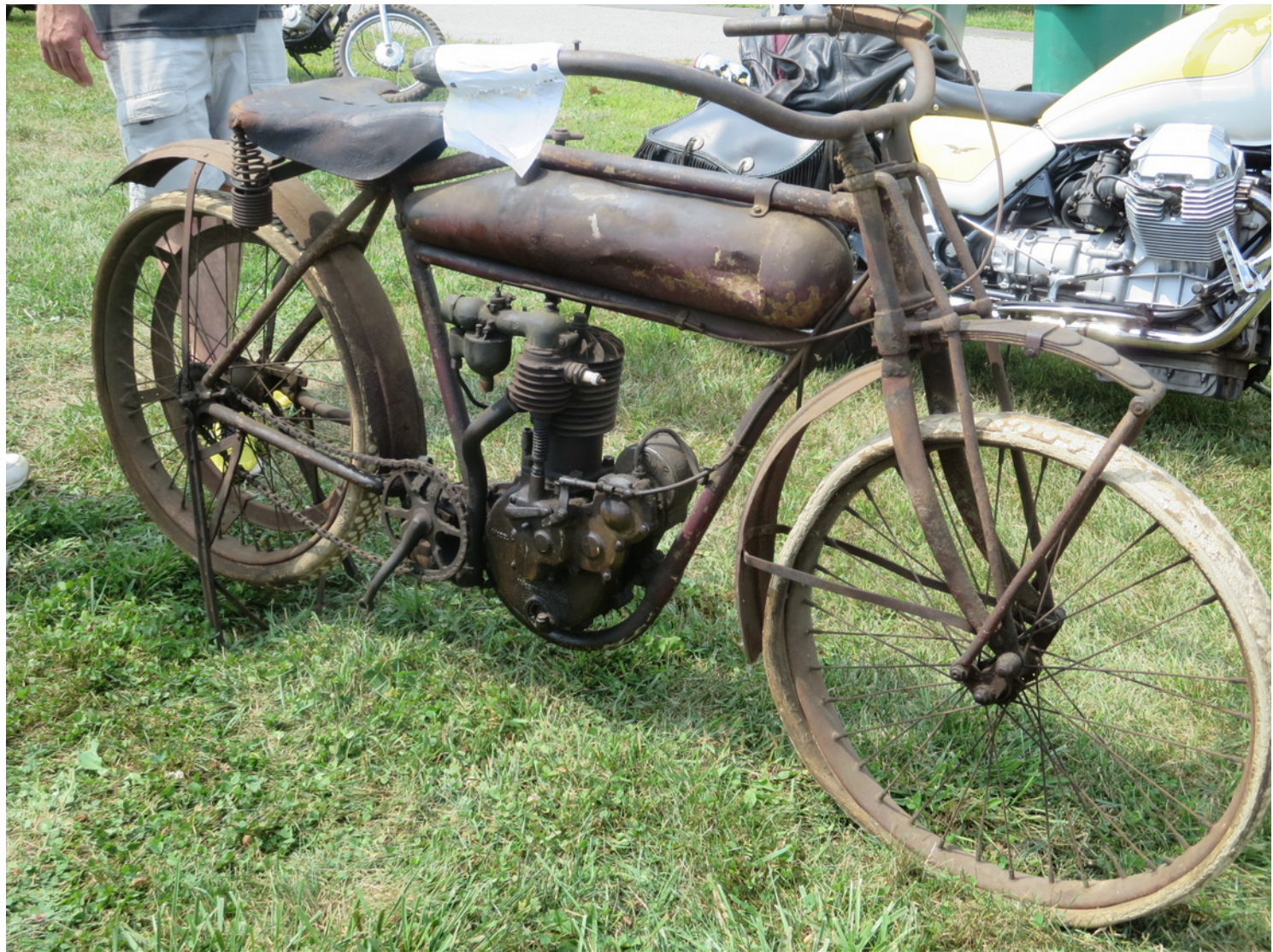
2014 National at Hebron