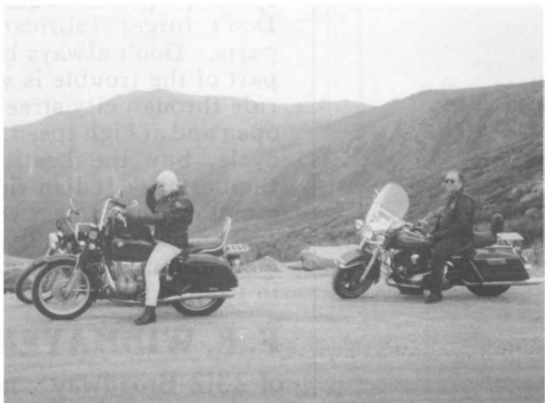
Sandy Gallo breathes a sigh of relief upon reaching the summit of Mount Washington, NH on the auto road as Gary Francois looks on.