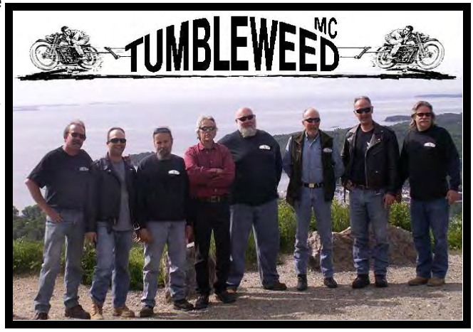
AMCA Maine Road Run 2009

You can see more on our web site tumbleweedmc.com. We are always looking for new members. So if you ride old motorcycles and like the old ways, e-mail us at tumbleweedmc@comcast.net