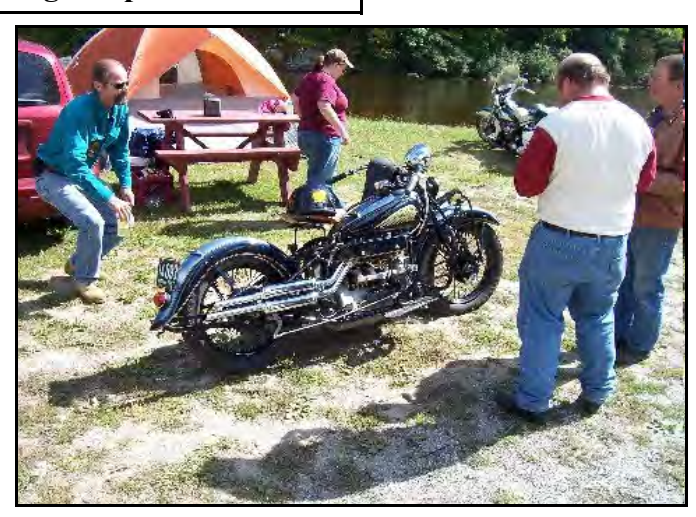
1937 Indian 4 police Bike