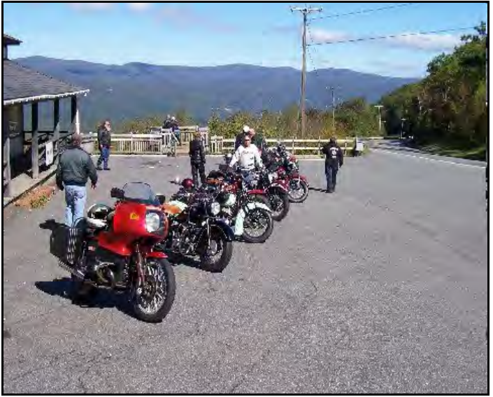
Rte 2 overlook above hairpin turn Florida, MA