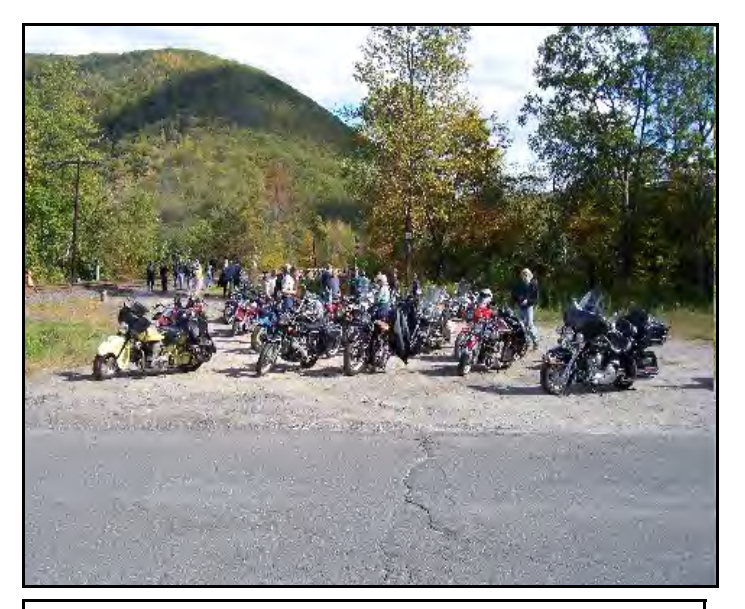
Group stop @ the Hossic Tunnel