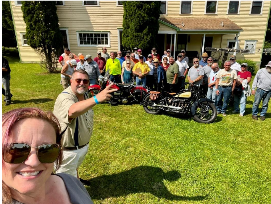
Where the AMCA began – the Wing house (formerly a barn).