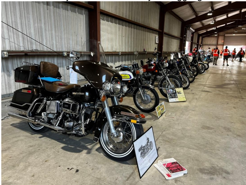
Some of the ~40 motorcycles that went through the judging process.