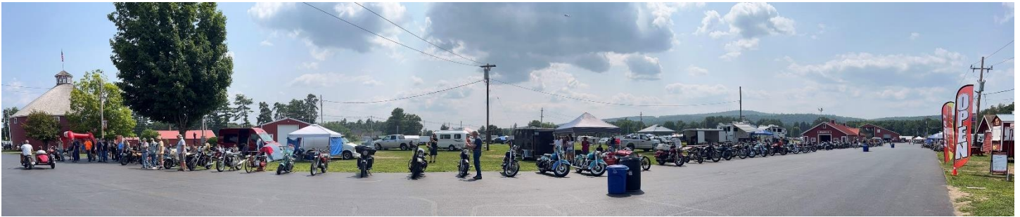
Saturday morning line up of vintage motorcycles.