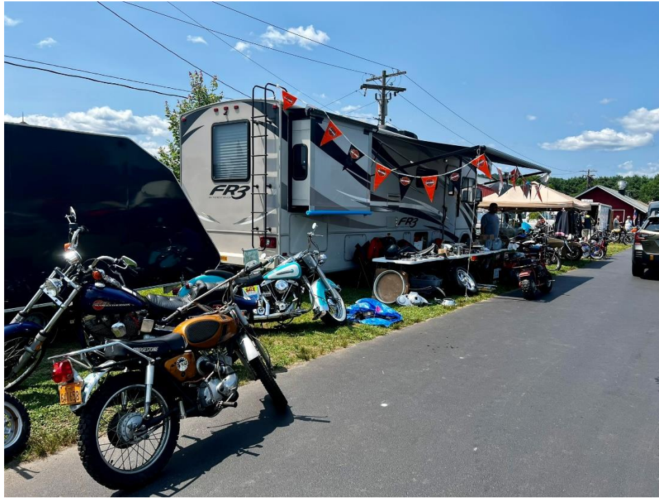
Plenty of vendors. Plenty of haggling!