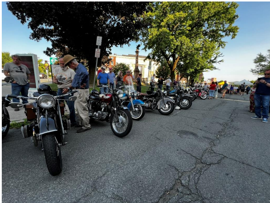
A group of motorcycles parked in Greenfield center following the parade.