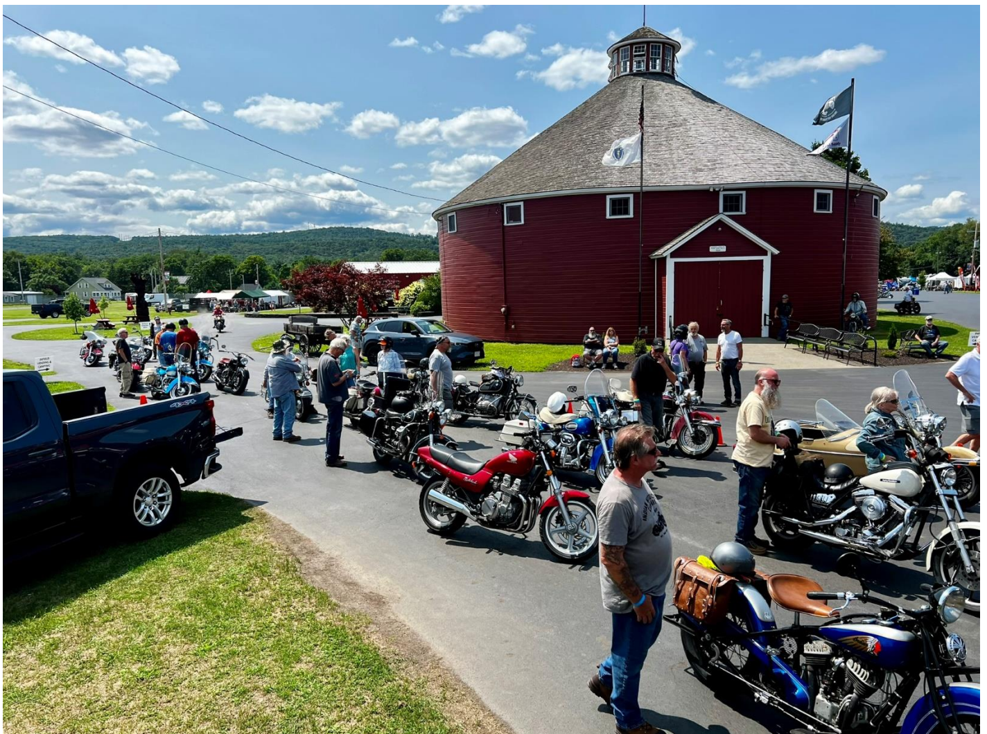
Getting ready for the ice cream ride.