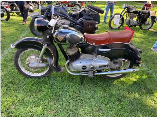
1955 Maico Taifun