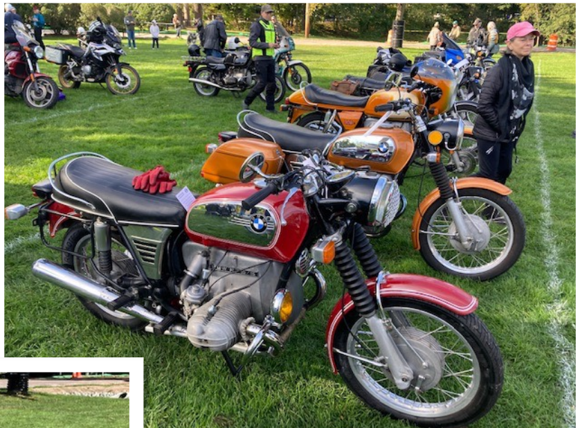
The 1970's BMW Lineup