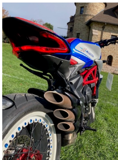
The "Business End" of a Modern MV Agusta