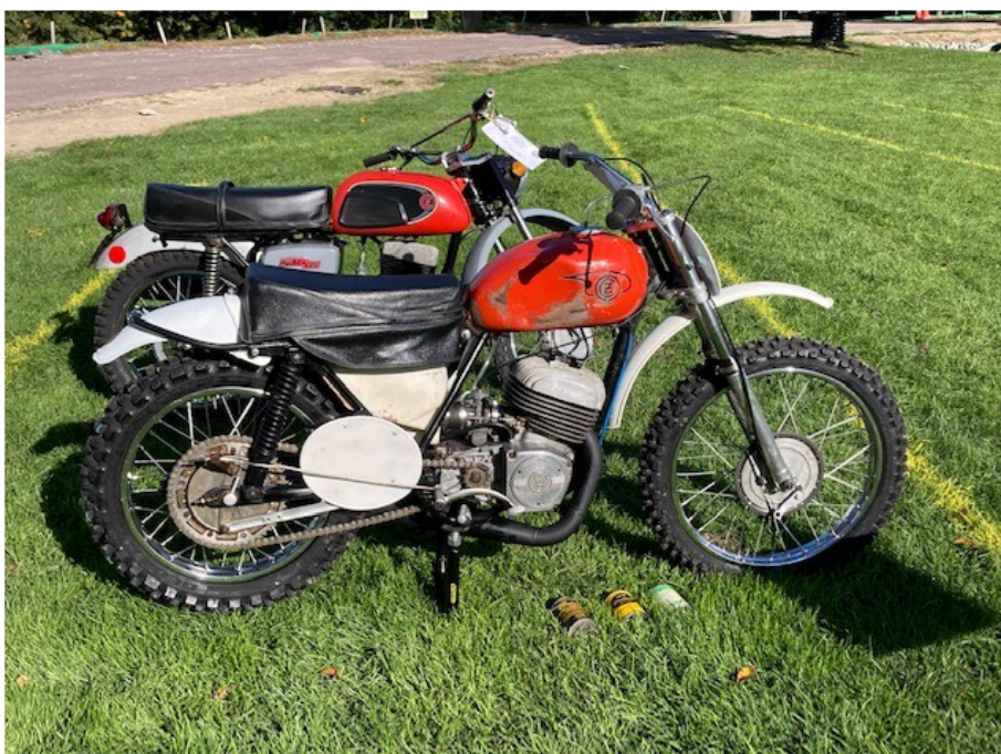
1970 CZ 360 Motocrosser in original condition.