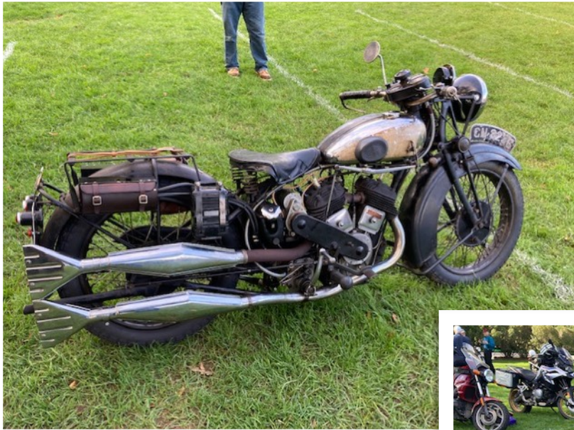
Unrestored 1930 Matchless