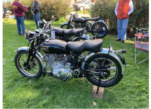
A Trio of Vincents