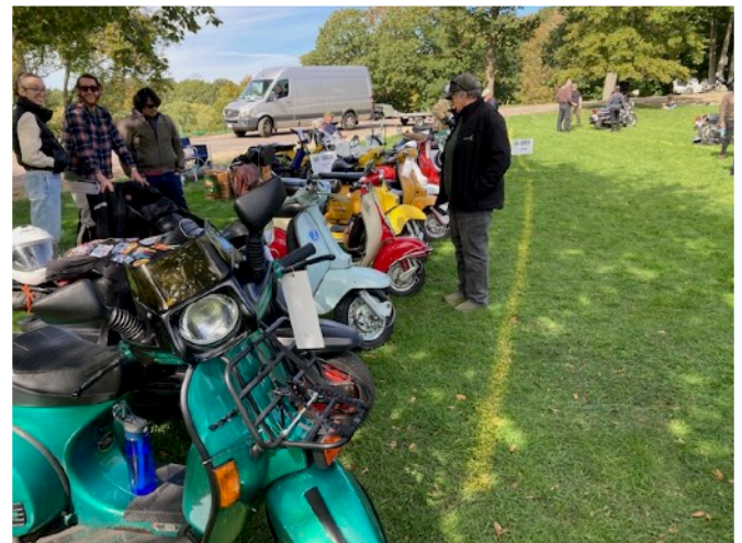
& A Flock of Vintage Scooters