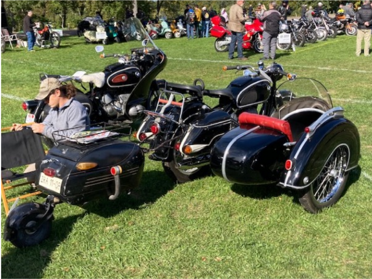
BMW R69S with a sidecar and a PAV40 trailer