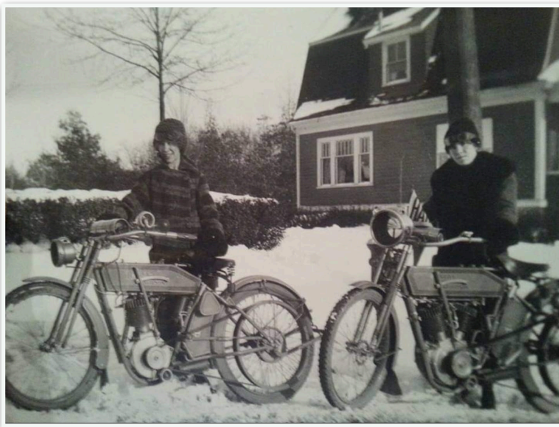
Attleboro, Mass. Circa 1915.